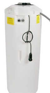
Water Works FWD3-1000