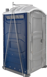
Sling Set MS02-1000